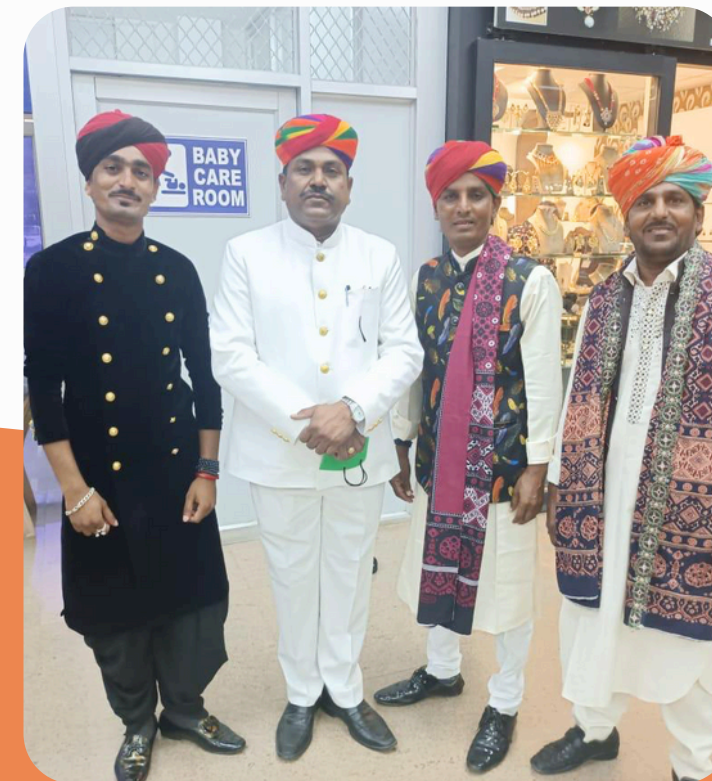
Promoting Rajasthani musicians in live shows across India and abroad