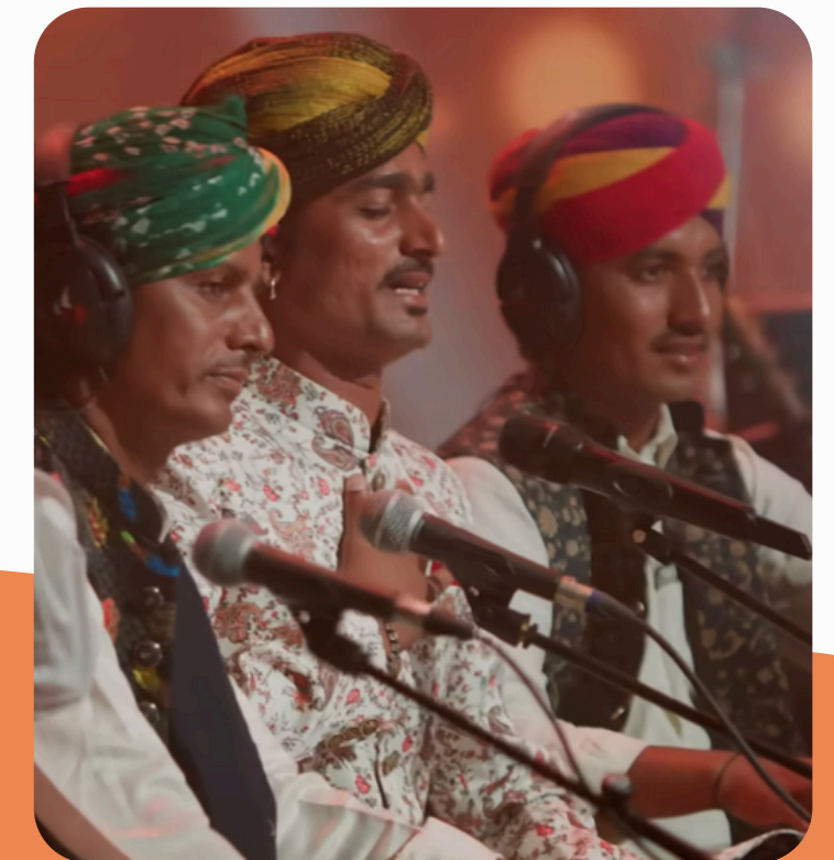
Featuring them in global music IPs such as Bhoomi, Coke Studio