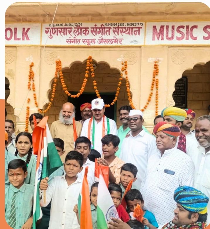
Globally renowned music school in the heart of the city