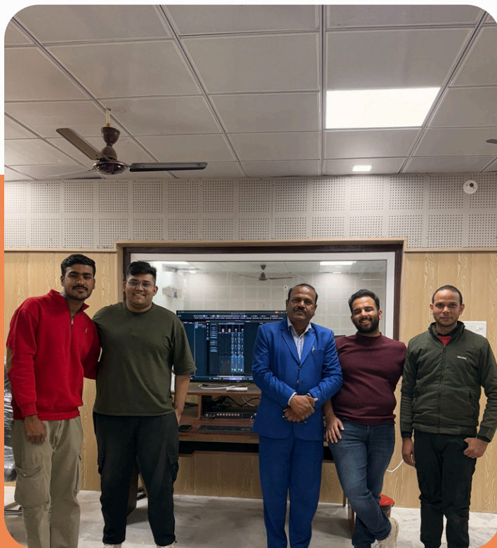
Set up the first studio in Jaisalmer